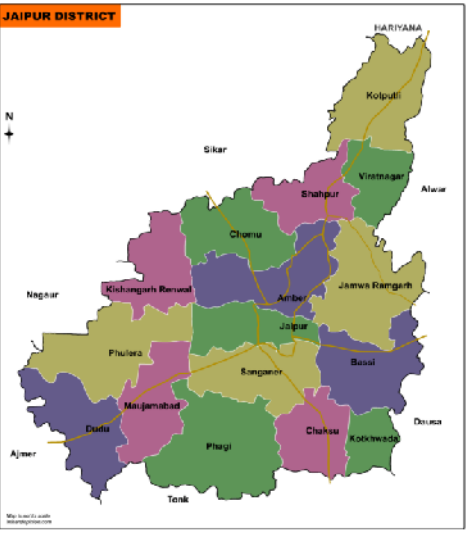
Fig. 1. Research area Phulera block.